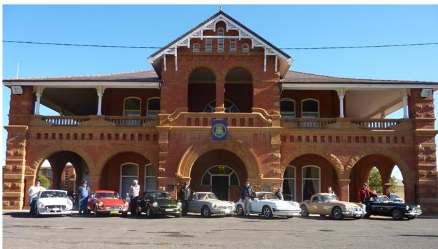
The MG's and their owners outside McCaughey.

On a recent Saturday, the MG Car Club from Wagga used the school as their rally point for the weekend. Many of these owners are past Yanconians and we welcomed their visit and hope they enjoyed their day.