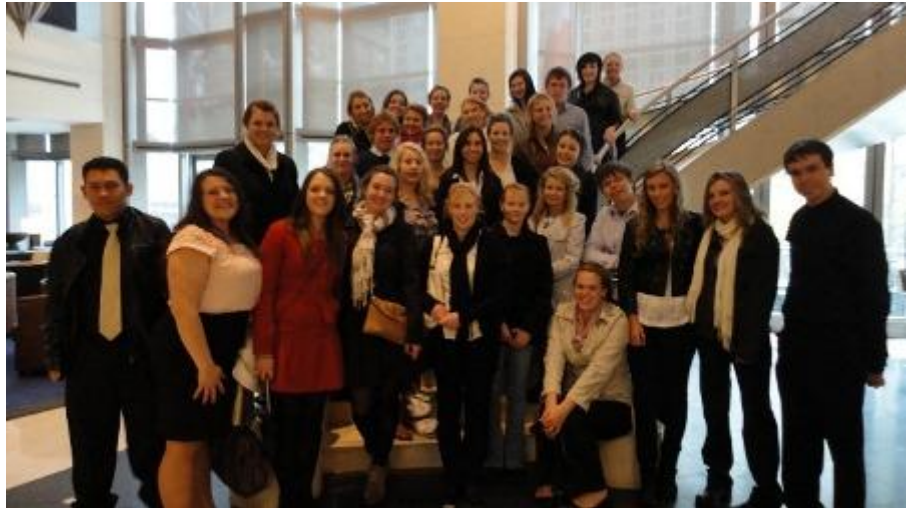
The Westin Hotel foyer

From here, we then visited the Westin Hotel. The tour around the Westin was amazing. There was a visible difference in the previous four star hotel to the fifth star. It was explained that the service had a lot to do with the rating, but we also saw that small difference in detailed decoration and attention to perfection. It provided pools, gyms, bars, and heaps of other facilities.