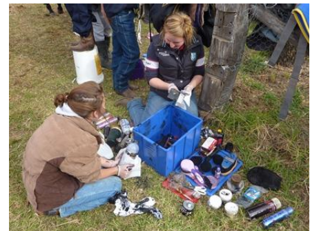
The preparation kit