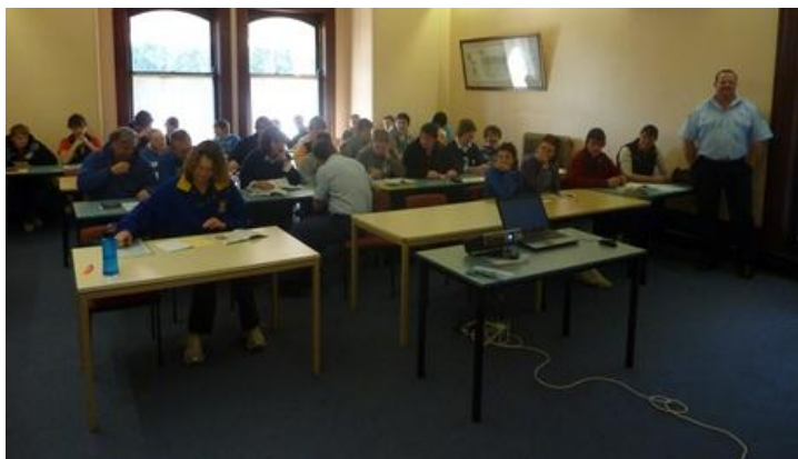
Boat License – students, staff and parents recently spending the weekend undertaking the theory.