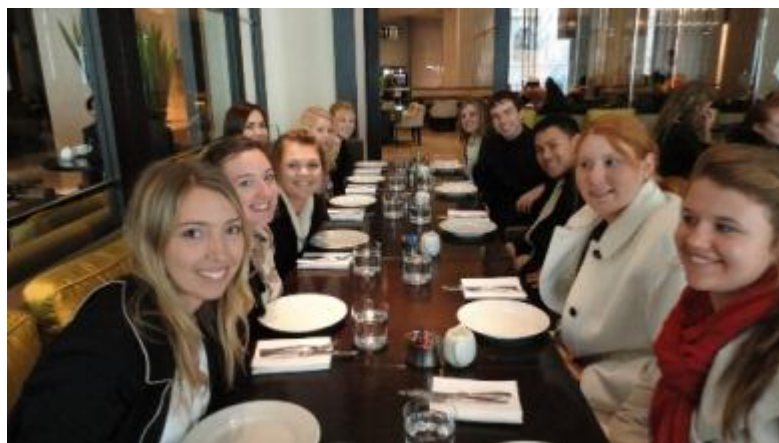
Waiting patiently for high tea to arrive.

The next visit was to the Grand Hyatt for a detailed tour of the kitchen and amazing High Tea. The specific kitchen we looked at was open and allowed guests to feel included in the preparation of their foods. It was interesting seeing the modernised designs and construction of the building and the different preparation of this level of hospitality. The whole atmosphere was elegant and was almost as good as the afternoon tea tasted. Delicious cakes and sandwiches were brought out in platters and orders of tea, hot chocolates and coffee were taken.