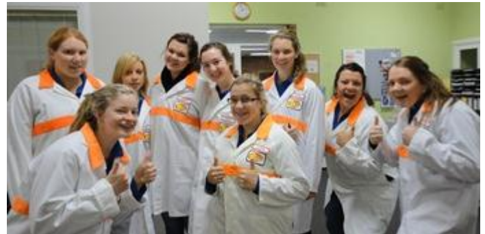
Year 12 Food Tech in their lab coats

and what processes are performed before a new product enters the market.