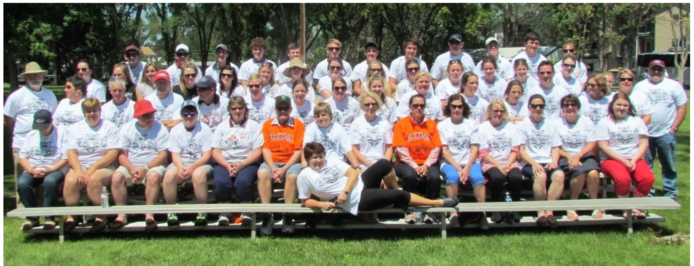
The Canada Crew

With endorsement by the Principal, the idea for a trip to USA/Canada in 2013 was put to the Yanco community in early 2011, and initially over 80 expressions of interest were received. The aim was to look at various aspects of agriculture in northern USA and Canada and to meet with some American families and experience their way of life. Eventually the group comprised 33 students and 29 adults for a total of 62.