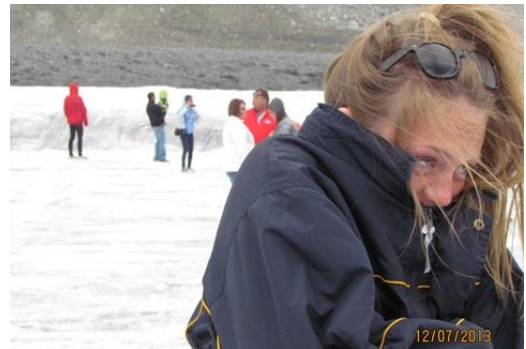
Glaciers are COLD!