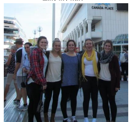
Aren't we cool?