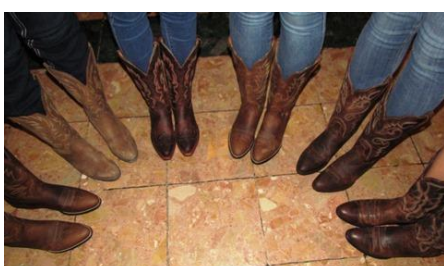
We love our new boots.