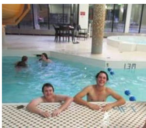
Fun in the hotel pool