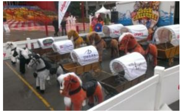
Mini Chuck Wagons