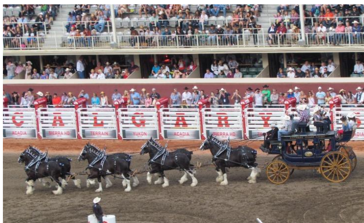
A Grand site