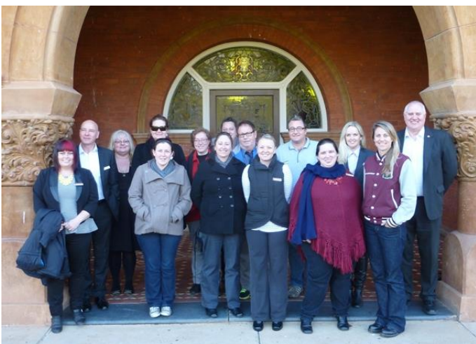
Visiting staff from Macquarie Fields and Prairiewood High Schools

Information regarding the plans for these alliances