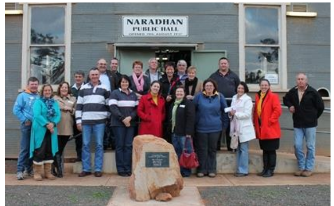
The P&C members outside the Naradhan Hall.