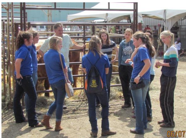
Sharing notes at the 4H show Saskatoon.