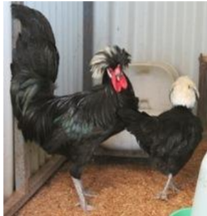
White Crested Black Polish Pair

Having selected a list of pens that were of our interest, we pushed our way into the midst of the auction and waited for our first pen, 43, a pair of Polish. The competition was fierce but we secured our first lot of birds at a reasonable price. Moving on, we waited out the front of pen 71 which contained a Dark Barred Plymouth Rock Rooster. This time there was very little competition and the rooster was picked up at a