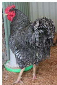
Dark Barred Plymouth Rock Rooster