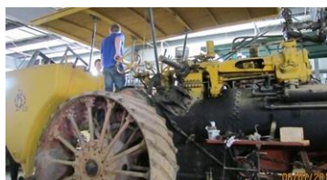
Lachlan inspects an old tractor