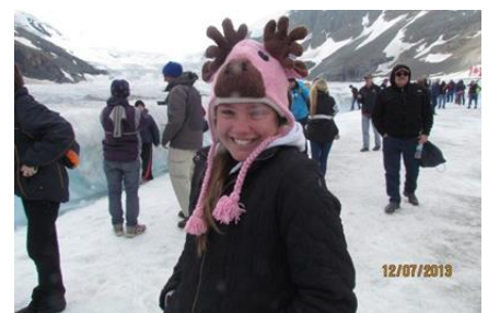
Like my hat?