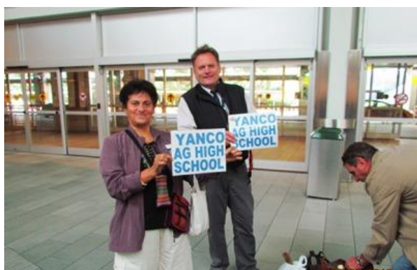
Tour guides in Vancouver