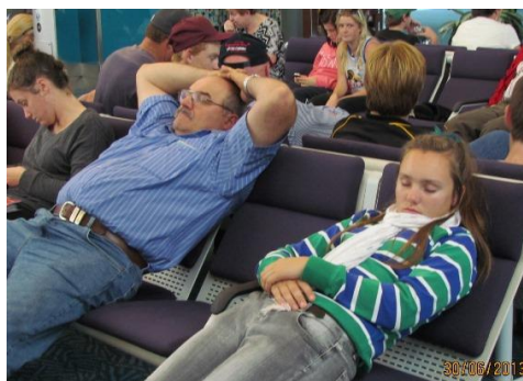
Travelling is tiring.