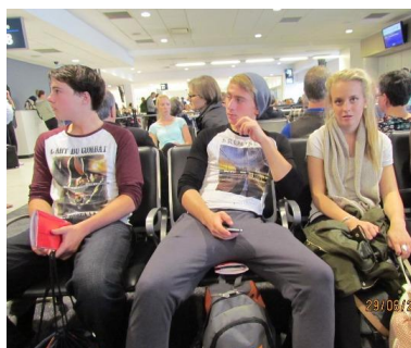
Not sure where we are going!