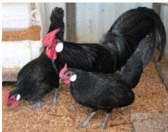
Rosecomb Bantam Trio

reasonable price as well. Next on the list was pen number 179, containing a spectacular trio of Rosecomb Bantams. We all believed the competition was going to be even larger than our previous attempts, as they were beautiful, well-bred birds, but the crowd must've seen the hunger for chicken in our eyes because we were the only bid, picking them up for a real bargain! We now have the beginnings of the Y.A.H.S Poultry Show Team, with these six beautiful school chooks, not to mention the other birds that our enthusiastic members own.