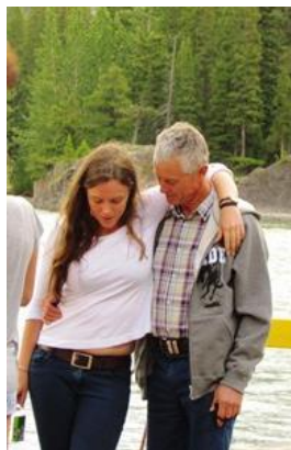
Dad and daughter in Banff