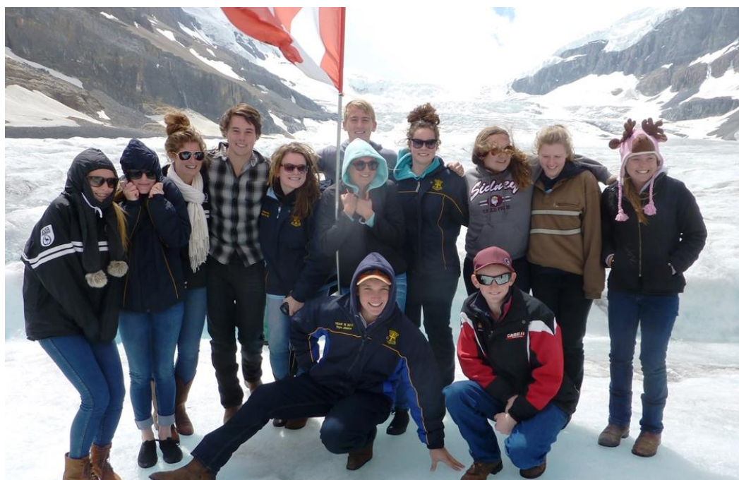
Yanco students feeling the cold on the Columbia Ice Fields in Canada on our recent trip. First discovered in 1843 it has receded almost 1.5 km since that time. On this ice field you are close to the top of the North American continent, almost 7000 feet above sea level, where three major rivers emanate from the ice field and flow into the Atlantic, Pacific and Arctic seas – look at a map to see this