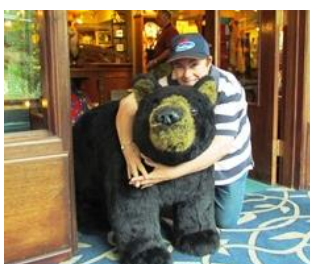
I found a bear.