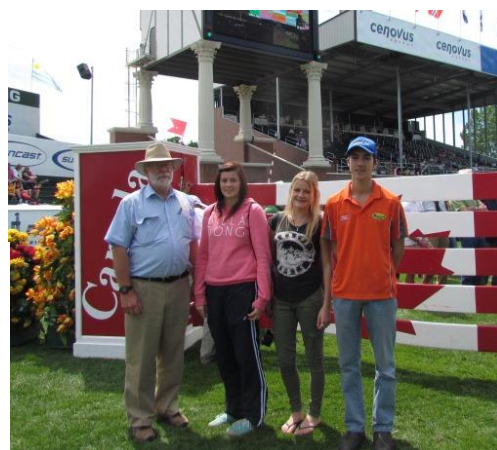
Spruce Meadows Show Jumping