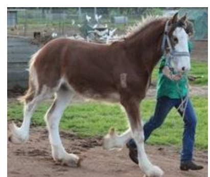
Will with 'Wally'