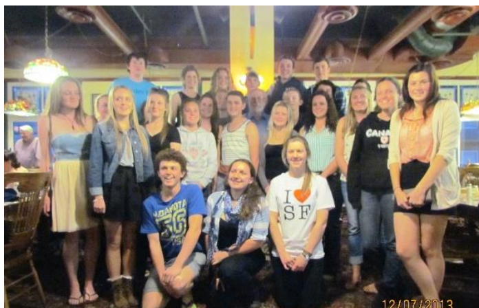
The whole group in the park at Sidney