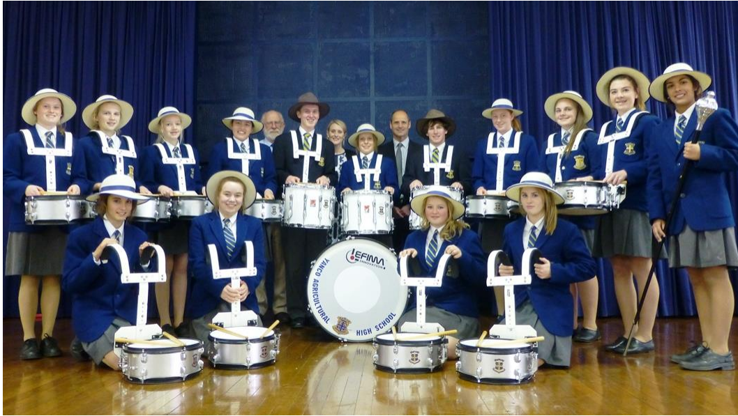
YAHS Drum Corp.

Monday the 28th of July the Drum Corp left YAHS at 9am and headed to Wagga Wagga to perform at the Market Place for the opening of Education week. When we got to the Market Place we found where we had to perform which was in front of Big W. We went through how we were going to stand, march on and off and when we were done we went back to the bus to have a rehearsal of what we were