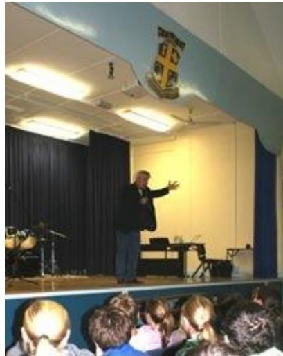
Mini concert in the hall

'Rain from Nowhere' has been credited with saving many lives, giving hope to lots of Aussies in the grip of depression and has been used by groups such as The Salvation Army, Black Dog Institute, Beyond Blue, Men's Shed and other community groups to both combat and destigmatize depression.