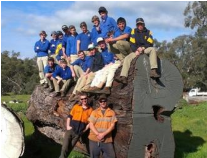
The Year 11 class and workers on an 18 tonne section of a tree salvaged from northern Victoria

A more complete series of photos will be in a later newsletter when the projects are able to be placed on display and the photos can do the projects justice.