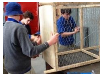
Chicken tractor construction