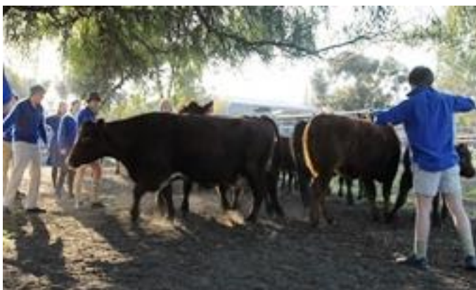
Year 12 Ag students drafting off cows in heat

responsible for selecting suitable females from the herds using genetic information and subjective and objective data.