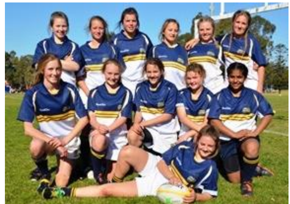
The Under 16's Team

The Under 16's played against Hunter River Sports High in their third game of the day and was defeated by only one try. By the end of the day the team had really gelled together and working well as a team in both attack and defence, whilst playing