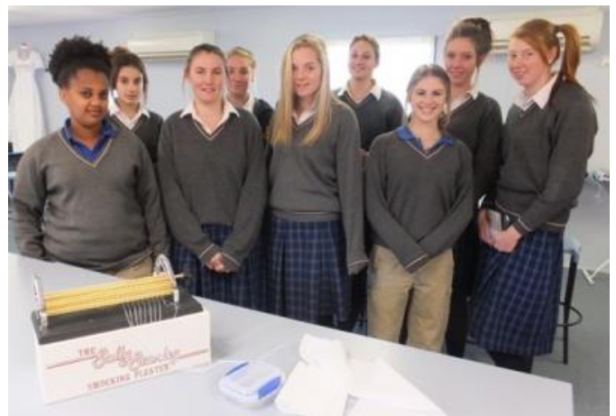
Stage 5 Textiles Technology Class 2014