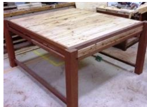
Scott O'Hara's dining table that expands into a ping pong table