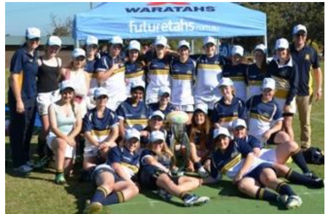
The Girls with the Super15's Trophy