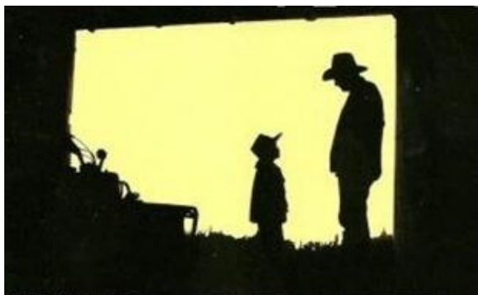
RAIN FROM NOWHERE