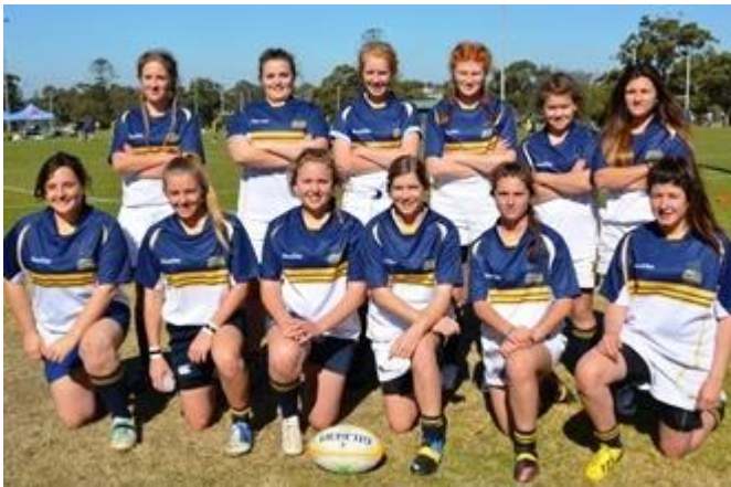
The Under 18's Team

The next morning we were up bright and early,