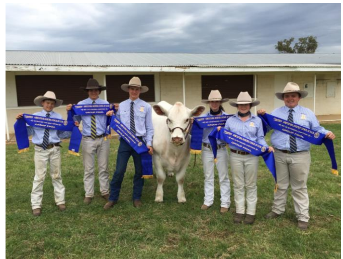
Qualifying students for the State Finals in Paraders to be held in Sydney 2016