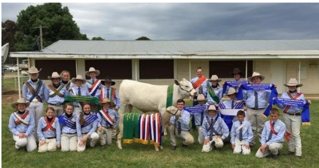
The very successful Cootamundra Show Sheep and Cattle Teams