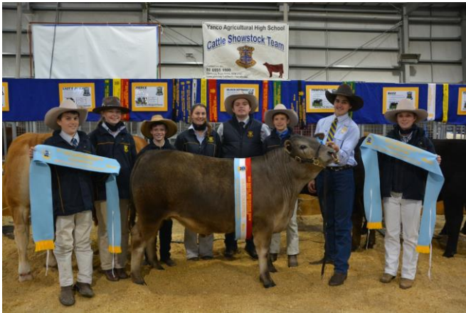
Yanco Melbourne Cattle Team

On Friday 17 th September eight students exhibiting eleven head of cattle travelled to Melbourne Showgrounds to attend the Royal Melbourne Show. We had a relatively early start, leaving school at 6:30am. A group of students travelled in the bus with Ms Weller while Mr Collins drove the cattle truck. We arrived in Melbourne at 2:30pm, unloaded the stock and settled them in to rest before setting up camp at the Big 4 Caravan Park.