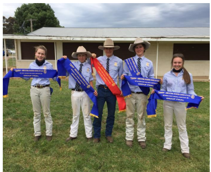
State Final qualifiers in Junior Judging