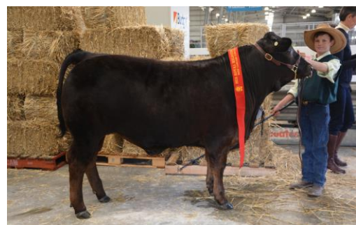
Cooper Carter with Limousin Steer LeMartres- Black Kernaghan who placed 2nd in his class

The weekend after we arrived back from Melbourne we received the carcase results back and we were satisfied with the results of the steers with all steers placing respectively in their weight divisions, The Murray Grey cross steer who was sashed Grand Champion Steer earlier that week, again brought the goods hanging up Reserve Champion Medium weight steer and some of the other steers were also awarded 80+ points and placing in their weight division classes.