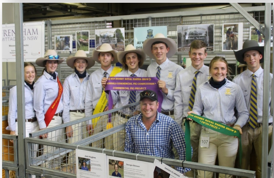
HOG SHOWSTOCK TEAM