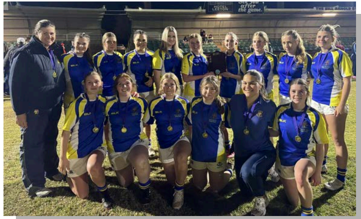
GIRLS RUGBY UNION DUNN CUP TRI-SERIES WINNING TEAM